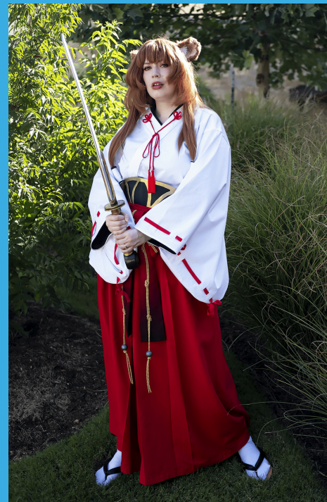
Raphtalia: Best in Show